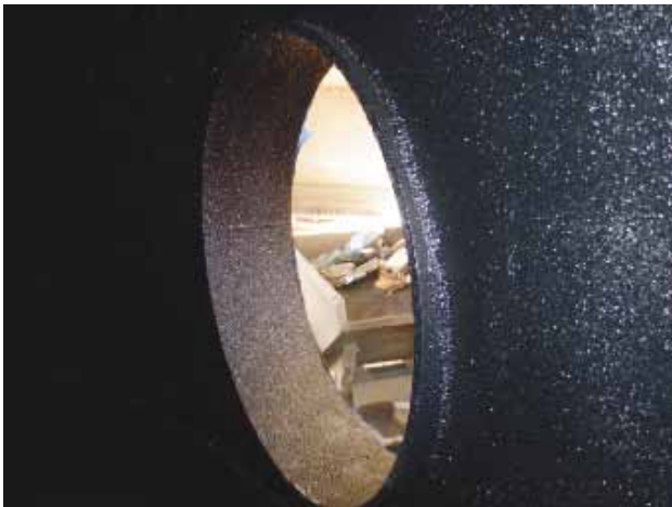
Figure 7. Internal stack coating applied in 2009.