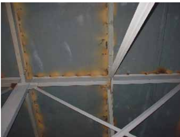
Figure 3. Internal baghouse inspection in 2004, prior to coating application.

thick. Inspection of this section took place during standard plant outage, following removal of the refractory brick. The appearance of substrate revealed severe corrosion. Numerous areas of pitted steel and orange peel delamination were apparent (Figure 1). The thickness of delamination appeared to be approximately 0.0625 in. steel loss.