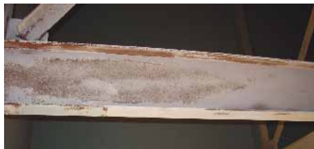
Figure 5. 2009 Inspection of 2004 baghouse coating revealed coating intact, however corrosion attack to supports is evident.