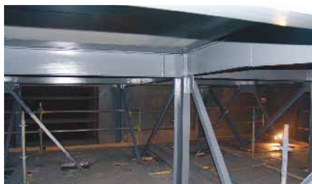
Figure 6. Baghouse coating applied to supports in 2009.