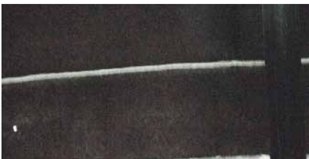
Figure 8. 2010 inspection of flare stack.