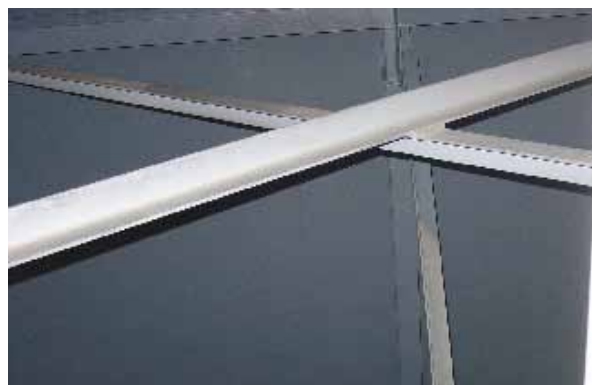
Figure 4. October 2004 - baghouse coating applied (excluding supports).

This case study began in February 2009. The lower 20 ft. of a main exhaust flare stack had what seemed to be a very porous appearance, and had large gaps between plates. Throughout