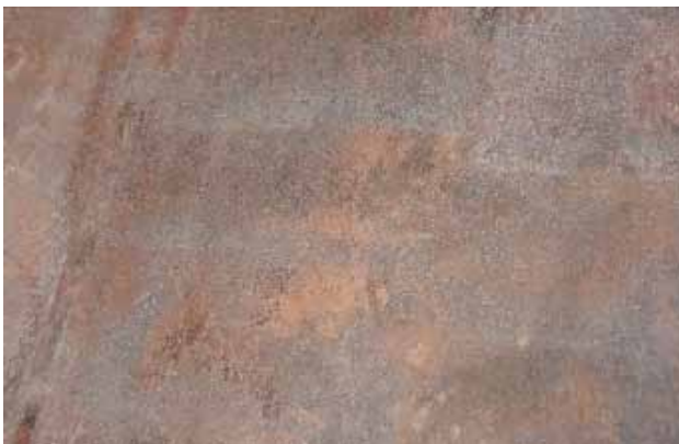
Figure 2. Inspection of 2001 kiln coating three years after application.