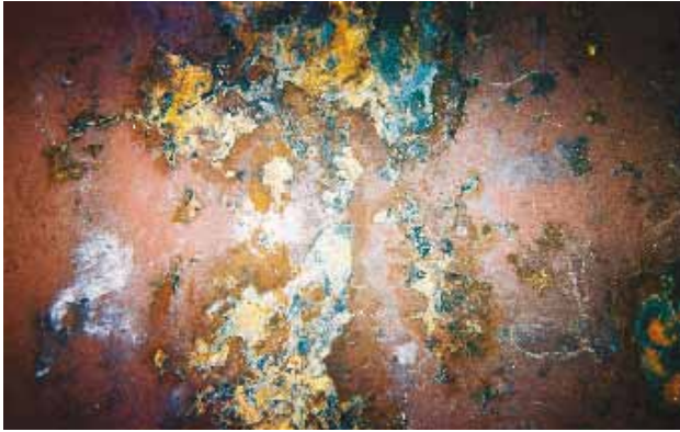
Figure 1. Corrosion of an untreated kiln.

In March 2001, the applicator was presented with a 20 ft. long x 13 ft. 6 in. dia. section of the internal kiln shell. The original steel thickness of the shell was approximately 0.5 - 1 in.