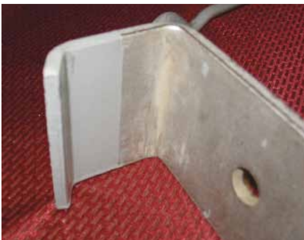
Figure 9. August 2009, coating of refractory clip.

capable of protecting the permeable state of the lower substrate.