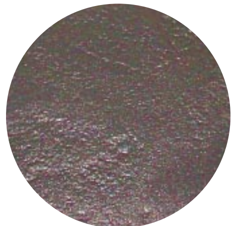
Figure 6: The coating applied to the internal wall of a flare stack.