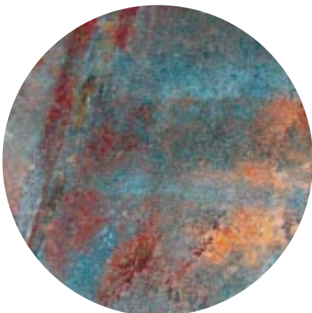
Figure 4: The same wall four years after application.