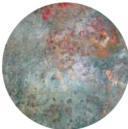
Figure 2: The kiln wall coating one year after application.