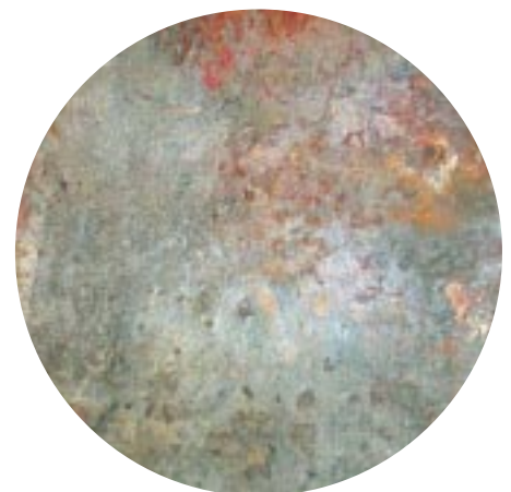
Figure 3: The kiln wall three years after application.